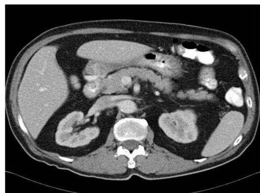
Figure 1. Abdominal CT image of the tumour in the left adrenal gland

description of a pigmented 'black' adrenal adenoma is a rare variant of this condition. It is often associated with hypercortisolism and is very rarely due to hyperaldosteronism. Due to its rare incidence, only