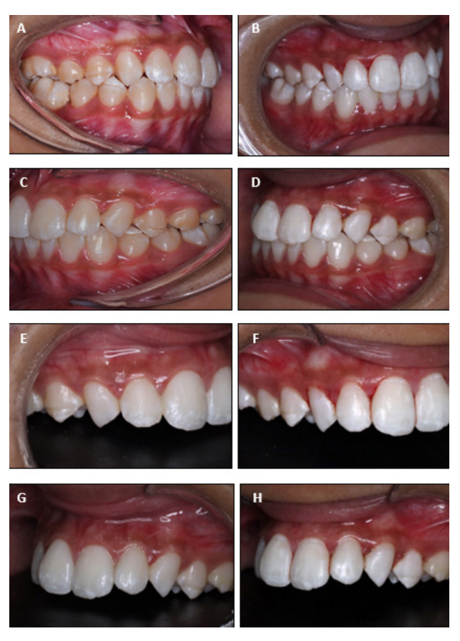
Figure 3: (A) Pre-operative right buccal view of fluorosis teeth prior to intervention (B) Post-operative right buccal view of fluorosis teeth after bleaching (C) Pre-operative left buccal view of fluorosis teeth prior to intervention (D) Post-operative left buccal view of fluorosis teeth after bleaching (E) Pre-operative view on teeth 14,13, 12 & 11 after bleaching (F) Post-operative view on teeth 14, 13, 12 & 11 after RI (G) Pre-operative view on teeth 21, 22, 23 & 24 after Bleaching (H) Postoperative view on teeth 21, 22, 23 & 24 after RI.