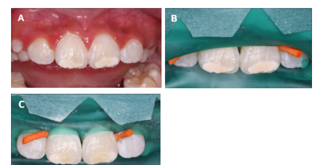
Figure 6: (A) Pre-operative Molar incisor hypomineralization teeth 11 and 21 prior to microabrasion and RI (B) Rubber dam placement on tooth 11 and 21 (C) Post-operative after microabrasion and RI.