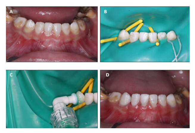
Figure 7: (A) Amelogenesis imperfecta on mandibular teeth (B) Isolation with rubber dam (C) Application of 15% Hydrochloric acid (ICON<sup>*</sup> Etch) (D) Appearance of amelogenesis imperfecta teeth after RI application on 73 to 83.