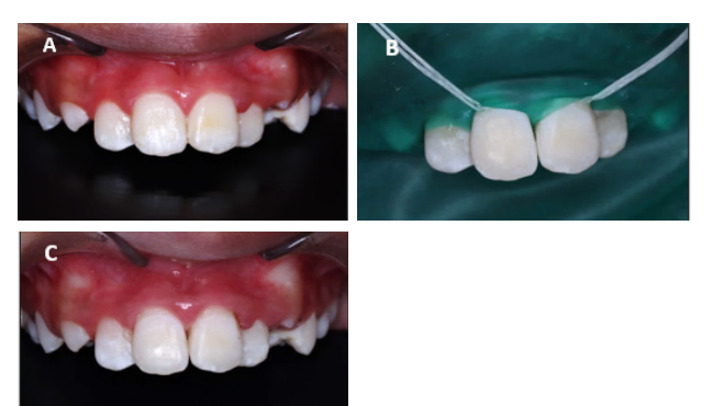
Figure 5 : (A) Pre-operative fluorosis on teeth 11 and 21 prior to RI (B) Rubber dam placement on teeth 11 and 21 (C) Post-operative after RI.