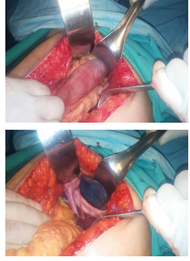
Figure 3 and 4: Surgical repair of diaphragmatic hernia using transabdominal approach

There was a defect on the right side of the diaphragm anteriorly, containing transverse colon which was easily delivered to the thorax (Figure 3,4). During surgery, the diaphragmatic defect was closed with polypropylene mesh. The patient's postoperative admission stay was uneventful and she was discharged on the third postoperative day. On the follow up visit, after two weeks, the patient was normal with significant improvement of her symptoms. Her wound healed, and normally stitches were removed.