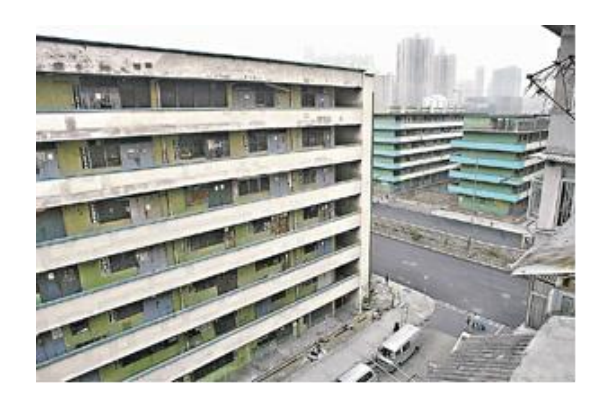
Figure 2: An obsolete flatted factory in Hong Kong