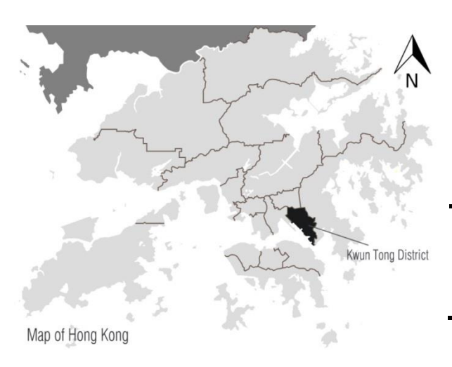
Figure 1: The location of Kwun Tong District

economic growth as its factories produced massive amounts of garments, electronics, toys, and other products. After the 1990s, most of the factories moved north to China in search of cheaper labour, and the light industries in the district faced a major decline. Hong Kong's manufacturing industries have declined from accounting for 21.8% as the major contributor to local Gross Domestic Product (GDP) index in 1981 to 2.5% in 2008 (Table 1). As the result of high vacancy rates in these warehouses, the government announced new policy measures to promote the revitalization of older industrial buildings through redevelopment and the wholesale conversion of vacant or under-utilized industrial buildings.