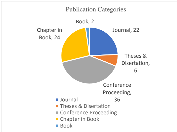
Pie Chart 3- Publication Categories