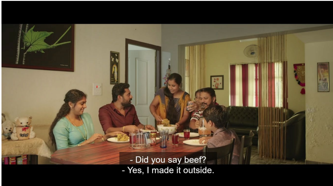
Figure 5. A screen grab from The Great Indian Kitchen . The newlywed couple and two male members of the family of the host are sitting across the dining table while the hostess is serving them food, her daughter standing beside her.

kitchen a space of ritual purity and the dining area a liminal zone of indulgence in the otherwise forbidden beef.