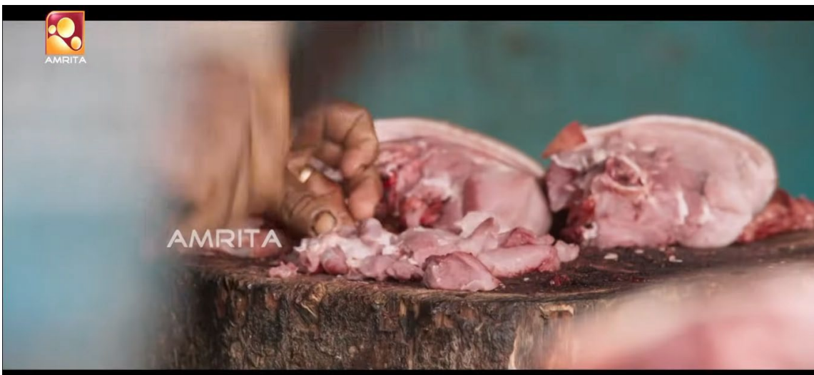
Figure 2. A close-up of the butcher dicing pork in Angamali Diaries . The butcher's body is blurred revealing at most the hands at work.

With the protagonist running a butchery and taking up the profession of a butcher, Angamali Diaries has conferred sanctity to the space of the butchery, dissociating it from ritual impurity and violence. Filmic focus has, thus, significantly shifted from the portrayal of the butcher as a villain as in earlier Malayalam films to the act of butchering, connecting it to consumption, and normalising the acts involved. The