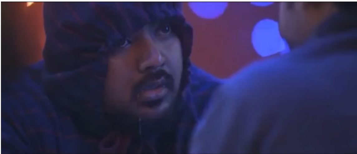
Figure 4. An over-the-shoulder shot from Godha showing the character Pandi facing Das and drooling over his vivid description of beef roast.

contemporary Malayalam films depict the consumption of non-vegetarian dishes, specifically beef, as a carnivalesque ritual involving laughter, subversive humour, playfulness, and fearlessness by setting it in a (non-Kerala) space that deems it transgressive. In the scene from Godha mentioned earlier, as Pandi drools over Das' evocative description of the beef roast, the camera captures his "ever unfinished, ever creating" (Bakhtin 26) grotesque body from an over-the-shoulder shot. The camera here assumes the gaze of a fellow diner in the restaurant, thereby furthering the grotesqueness of his body, an element that contributes to carnivalesque. Here, Pandi wilfully dismisses the etiquettes of a dining space and the entire conversation regarding beef goes against the existing order of the space, the official, and societal norms, as in a carnival. Laughter invoked here, which Bakhtin identifies as a distinguishing feature of the grotesque manifestations (38), has played a constructive role in popularising the scene.