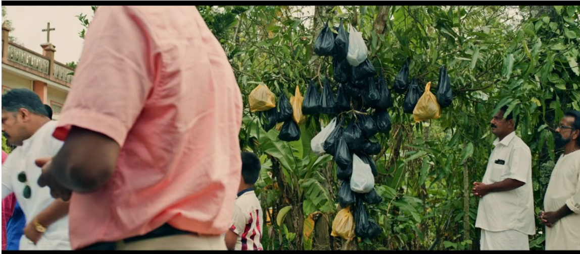
Figure 3. Parcels of beef hanging on a tree in the front yard of a church in Jallikattu . A church cross also forms part of the visual.

that even the pattern in which the meat bags are arranged on the tree resembles the shape of a cross. While the church and the cross rely on the flesh and blood of Jesus Christ, it is the flesh of the animal that makes the tree in the courtyard a significant one for the believers, who celebrate both the mutilated bodies with ritual fervour.