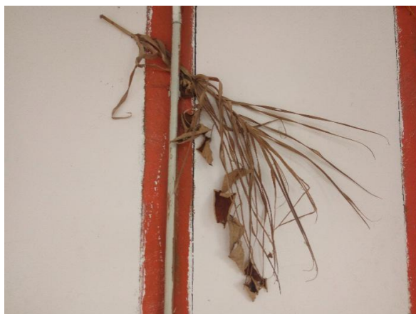
Figure 2: Bikarom