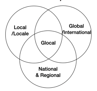
Figure 3. An Interpretation of Brock's Model of Analytical Scales for Education

A third contribution is Brock's emphasis on the importance of scale. Scale in geography refers to an actual or imagined framing of the space. He regarded the national scale as the normal regulated space produced through national educational policy, however, the national total or average view in education statistics is often misled by the complexity of education provision. Therefore, he argued that the local-global dynamics in education should be understood with reference to, instead of absence from, national and regional scales that connect and contrast the local and the global. Figure 3 is made to illustrate his view of connected scales from local to global.